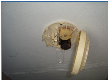
Non-Functioning Smoke/Carbon Monoxide Detector